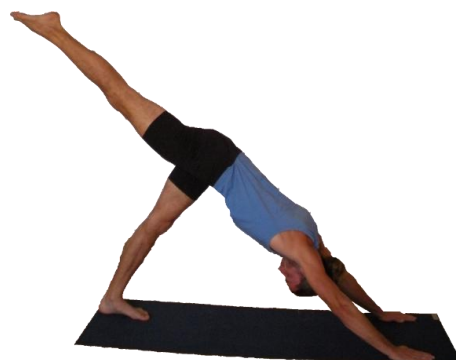
Eka Pada Bhudarasana