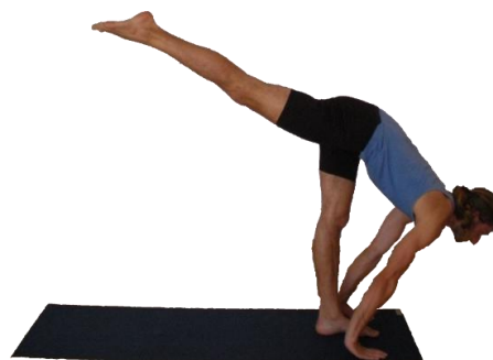
Urdhva Prasarita Eka Pada Uttanasana

Dhristi: Look forward to the spot on the floor.