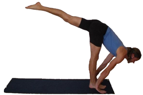
Urdhva Prasarita Eka Pada Uttanasana